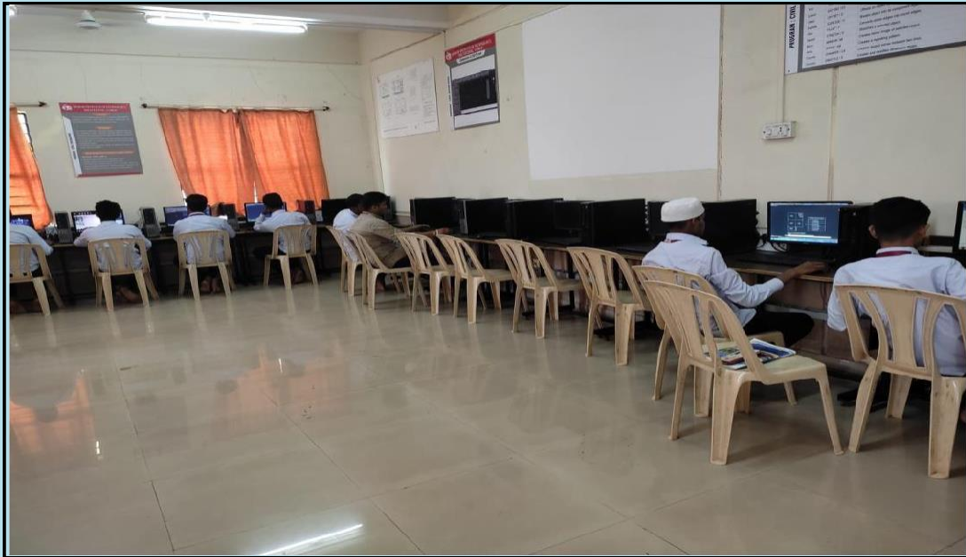
Photo Gallery Laboratories of Department