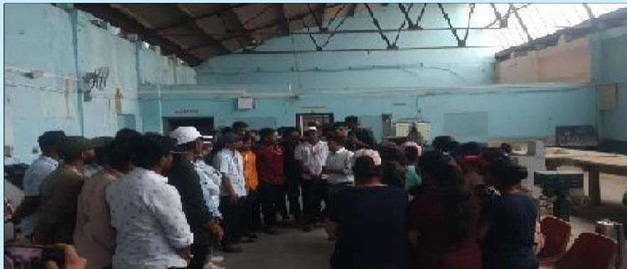
Visit at Meri Nashik