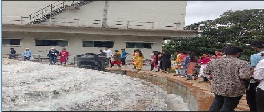
Visit at Water Treatment Plant