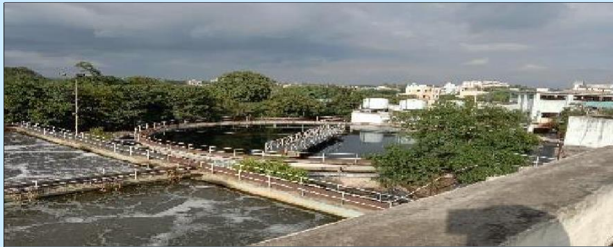
Visit at Effluent Treatment plant