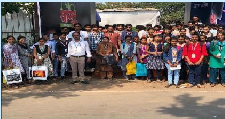
Vastu Exhibition 2022