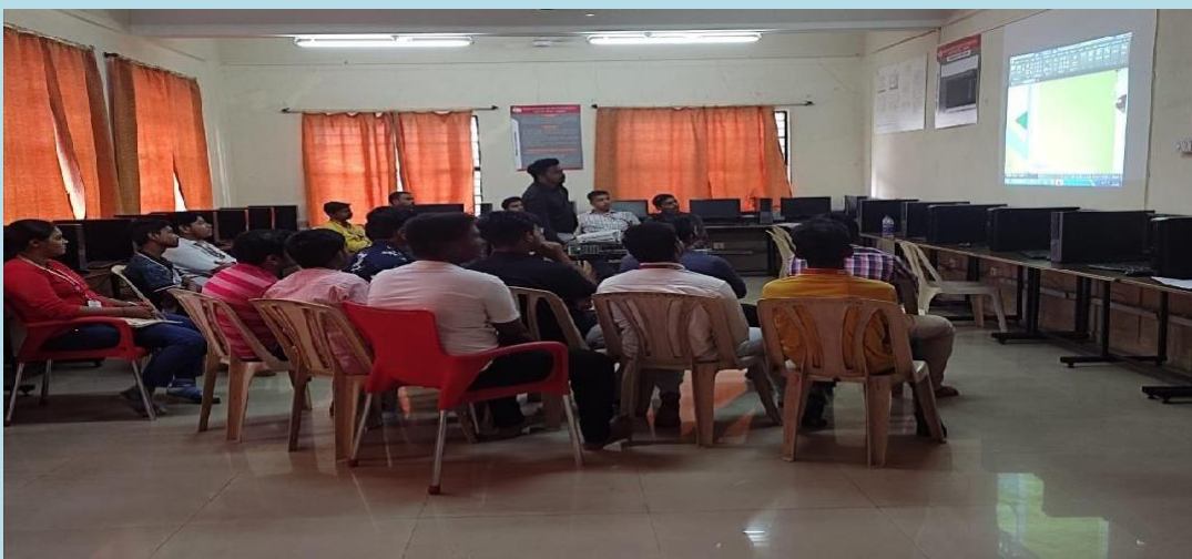
Workshop on Auto CAD 2D and 3D