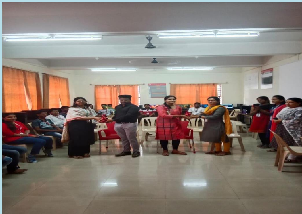
Workshop on Auto CAD 2D and 3D